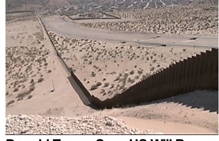
Donald Trump Says US Will Be 'Paid Back' by Mexico for Wall