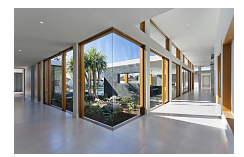
Use Data To Sell Your Home Fast Homelight