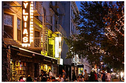
Journey to Jazz-Age New York City Via Harlem's Local Haunts