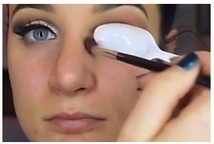
How To: Get Rid of Dark Under Eye Circles